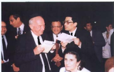
以色列總理拉賓 Yitzhak Rabin, 1993.

中心近年來推出的重要學術成果有：論文集《猶太以色列研究》，大型書冊《猶太人在上海》、《猶太人在中國》，論著《猶太人憶上海》，專著《猶太民族復興之路》，《猶太文明》、《猶太之旅》、《一個半世紀以來的上海猶太人》，圖片展“猶太人在上海”等。中心還發起或參與組織了多次國內或國際學術討論會、上海猶太人重聚活動，以及有關猶太名人、納粹大屠殺和今日以色列的展覽會，還在中國首次舉辦了少兒希伯來文班及成人業餘希伯來文班。中心與影視界合作制作的有關中國、上海猶太人的影視作品和中心與旅遊界合作編制的上海猶太遺迹遊覽圖受到廣泛歡迎。