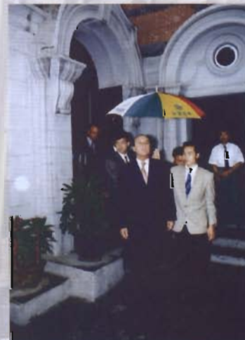
奧地利總統克萊斯蒂爾 Thomas Klestil, 1995.