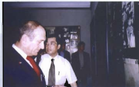
以色列總理奧爾默特 Ehud Olmert, 2004.