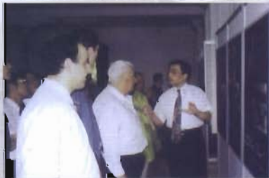
以色列總理沙龍 Ariel Sharon, 1998.