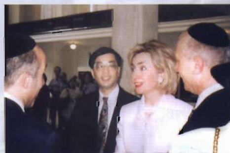
美國第一夫人希拉裏 Hillary Clinton, 1998

Established in 1988, the Center of Jewish Studies Shanghai (CJSS) is the most influential research institution in China on Jewish and Israeli Studies. It not only coordinates the research activities both in Shanghai and China, but also actively collaborates with scholars from all over the world.