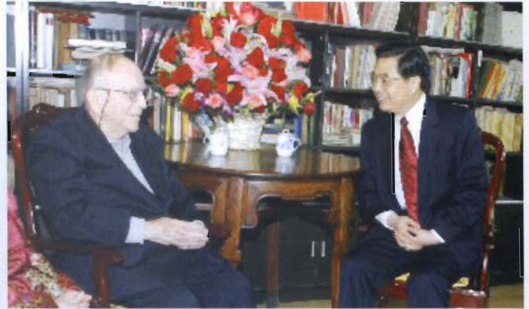
胡錦濤主席祝賀本中心永遠榮譽顧問愛潑斯坦90壽辰 Hu Jintao, President of PRC, met Israel Epstein, Founding Honorary Advisor of CJSS, at the ceremony marking his 90th birthday.