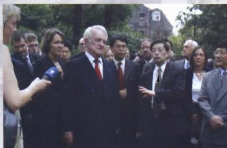
德國總統約翰內斯·勞 Johannes Rau, 2003.