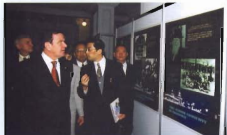
德國總理施羅德 Gerhard Schroder, 1999.